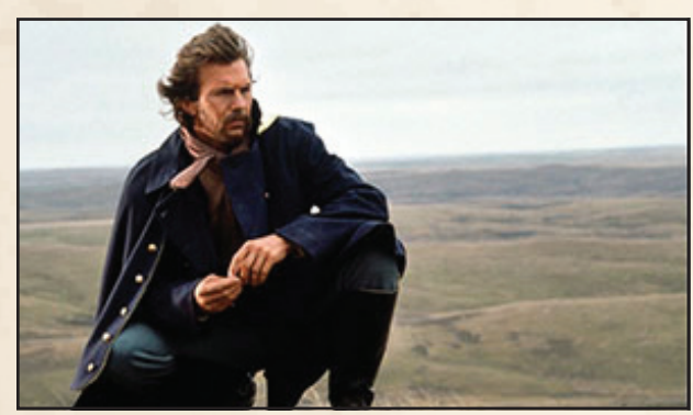
Fort Hays, popularized by Academy Award-winning, including Best Picture, "Dances With Wolves"